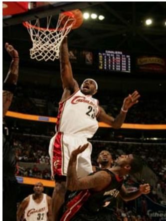
Can this man be the first professional athlete to become a billionaire? We would not bet against him.

With a framed ticket from the last All-Star game played in Chicago (1988) and a remembrance of when the A-train was not a underachieving running back on the Bears but a 20 and 10 machine named Artis Gilmore, I have seen the NBA go on a rollercoaster ride of acclimation and credibility.