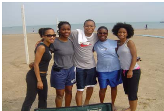
Want to get beach ready? Join us every Saturday morning for the iTZ Boot Camp!

and you want to get tank top, sun dress and bikini ready! Or maybe you want to get in better shape to perform better out there on the diamond or gridiron? Perhaps you just want to get into a fun activity and finally start living up to that new years resolution to live a bit healthier and get in better shape? Whatever your motivation, this is the boot camp for you!